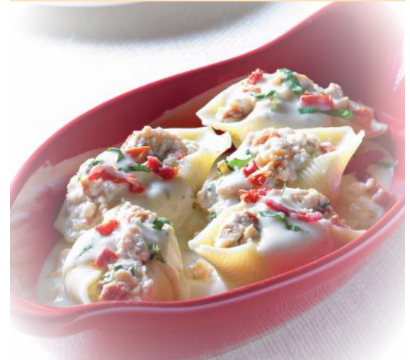
made with Chopped Ocean Clams